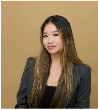
MKT Student, 4th year