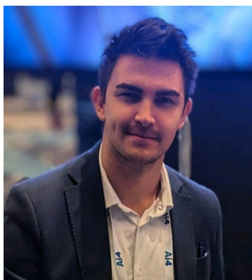
Product Manager, SOTI