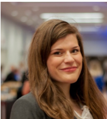
Senior Business Analyst, BMO