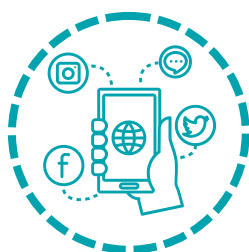
Leveraging Social Media

According to the Government of Canada's Job Bank, there will be a demand for Recruiters skilled in the utilization of social media. Being able to identify and hire strong candidates using social media is of interest to employers. Understanding how to use technology to recruit candidates remotely, and being able to pitch new strategies regarding hiring processes is now considered highly desirable 3 .