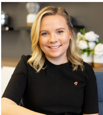
Retail Management Alumna