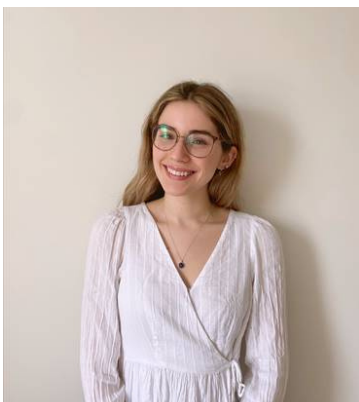
5th Yr. Marketing Student