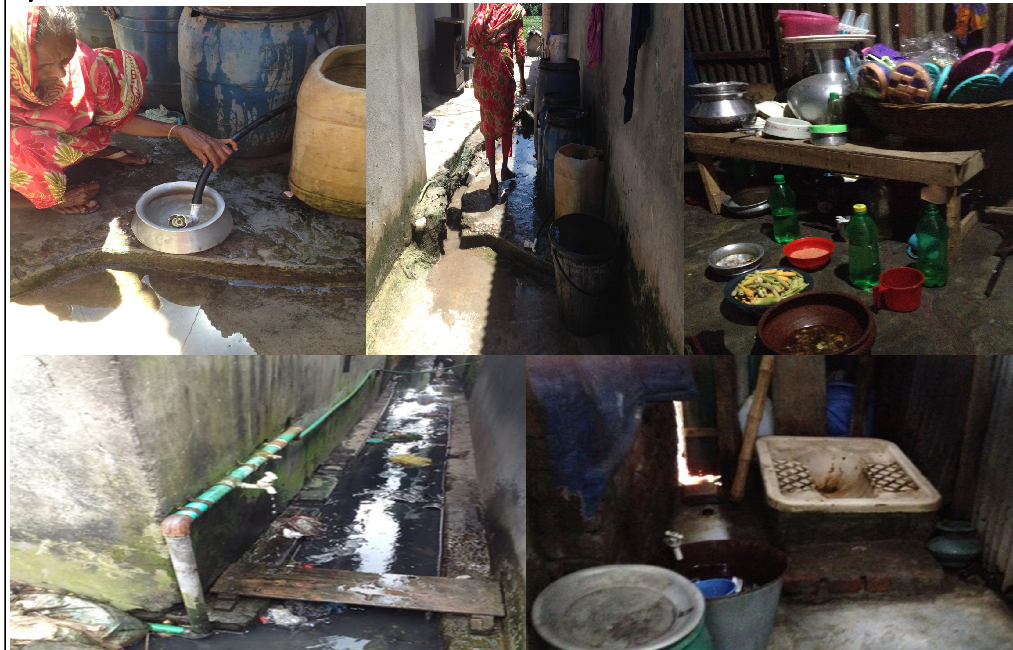
Poor toilet conditions, drinking water tap, water storage pot/ bottles