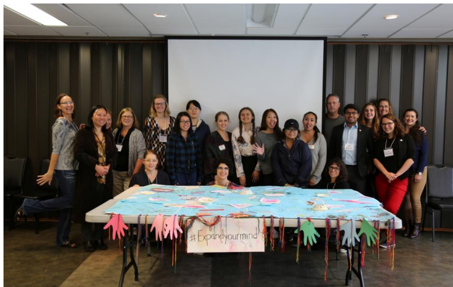
Some of the October 2 nd Symposium attendees with collaborative art piece entitled “#Expandyourmind”

The reality is that dementia is disproportionately underfunded and under-researched in terms of its economic, social, and health burden. A key problem is the shifting cultural framing of dementia in dominant discourse that continually fails to humanize individuals with dementia thus creating massive social distance, especially between teenagers and those living with dementia.