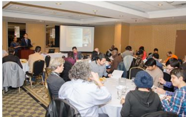
CHAMP Research Report Launch attended by over 100 stake holders, including researchers and policy-makers