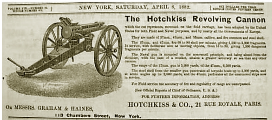
Figure 1.3. Hotchkiss Revolving Cannon

Ideologies of US settler colonialism directly informed Australian settler colonialism. South African apartheid townships, the kill-zones in what became the Philippine colony, then nation-state, the checkerboarding of Palestinian land with checkpoints, were modeled after U.S. seizures of land and containments of Indian bodies to reservations. The racial science developed in the U.S. (a settler colonial racial science) informed Hitler’s designs on racial purity (“This book is my bible” he said of Madison Grant’s The Passing of the Great Race ). The admiration is sometimes mutual, the doctors and administrators of forced sterilizations of black, Native, disabled, poor, and mostly female people - The Sterilization Act accompanied the Racial Integrity Act and the Pocohontas Exception - praised the Nazi eugenics program. Forced sterilizations became illegal in California in 1964. The management technologies of North American settler colonialism have provided the tools for internal colonialisms elsewhere.