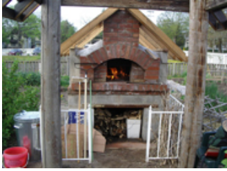
A bake oven in downtown Kitchener

The Betinho Project is being launched by the building of a Community Bake Oven which will be dedicated to Betinho. The Bake Oven will be constructed as part of "the Green Barn" in the Green Arts Barns Project in Wychwood Park in Toronto. The Green Barn will be managed by The Stop Community Food Centre and will include a greenhouse, the community bake oven, and a community garden.