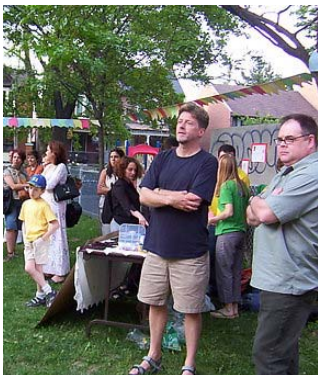
The Stop Community Food Centre , 1884 Davenport Rd., Toronto

The launch was a great success, thanks to the contributions of many people. Guests from both the Brazilian and Canadian communities, had an enjoyable evening and learned something as well. We officially began collecting donations for the building