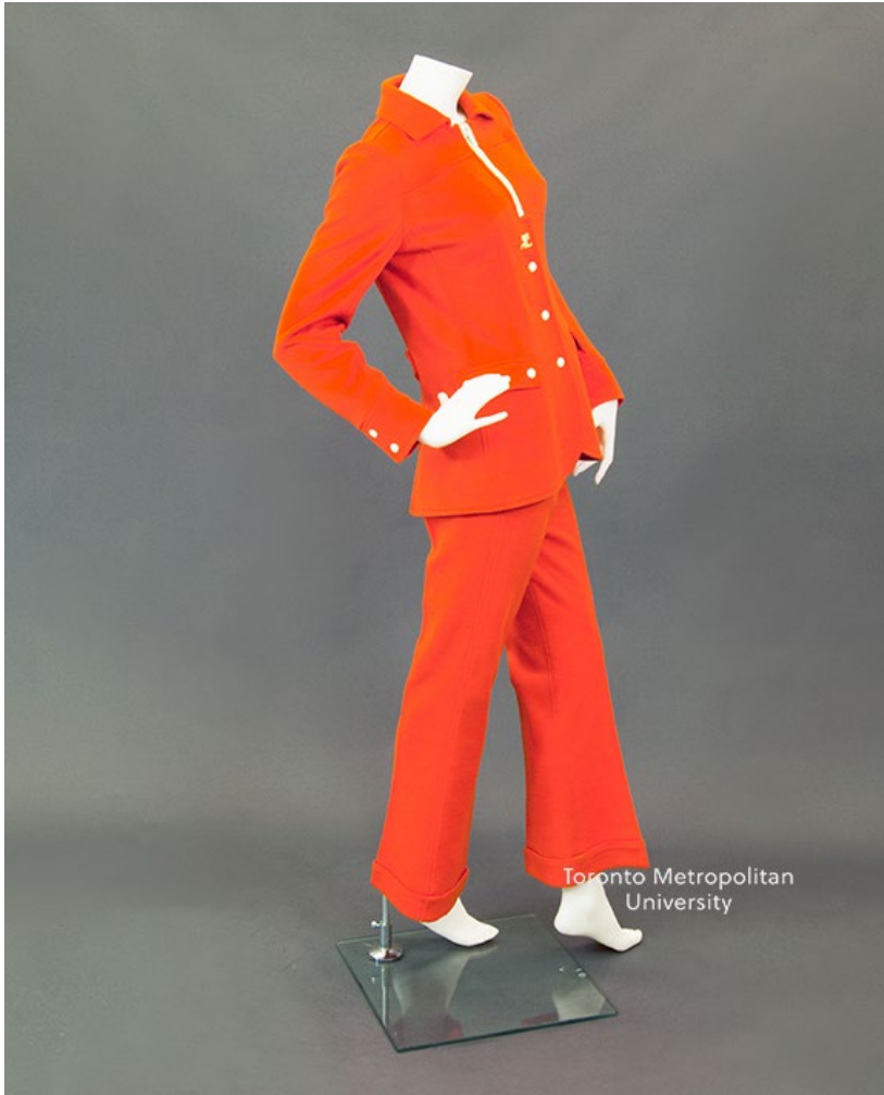
Courrèges pantsuit, ca. 1970s. Toronto Metropolitan University FRC2013.02.009AB. Gift of Anonymous donor.