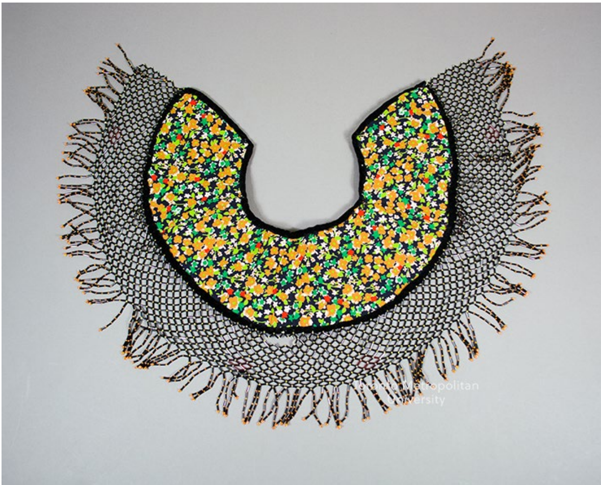
Cree women's round dance cape, ca. 1960s. Toronto Metropolitan University FRC2019.01.004. Inside of Cape. Donated by Weidenhammer Family.