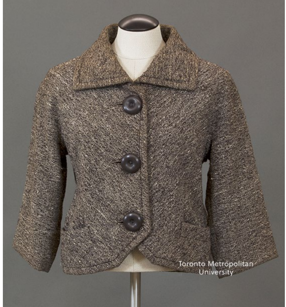
Dior brown boucle wool jacket, ca. 1956. Toronto Metropolitan University FRC2013.99.007.