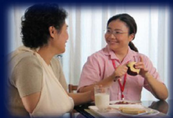
PSW HOMEMAKING SERVICE Carefirst Seniors & Community Services