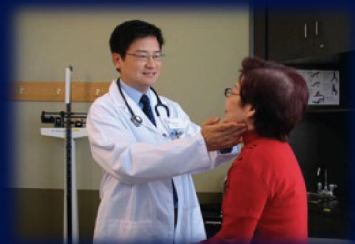
FAMILY HEALTH CENTRE Carefirst Seniors & Community Services