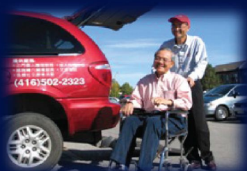
TRANSPORTATION SERVICES Carefirst Seniors & Community Services

Send an email to crncc@ryerson.ca for application and guidelines