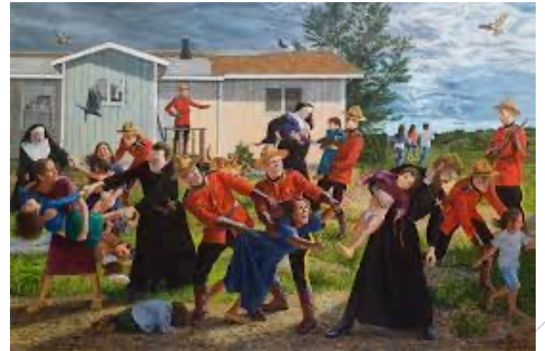
Kent Monkman “The Scream”